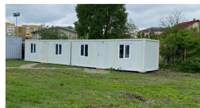
Modular homes that are fully equipped to provide safe shelter for Ukrainian families. They cost $15,000 each. The goal is to see this piece of land full of safe homes. Can you help us?