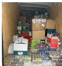
One of the truckload of life supporting supplies sent into Ukraine.