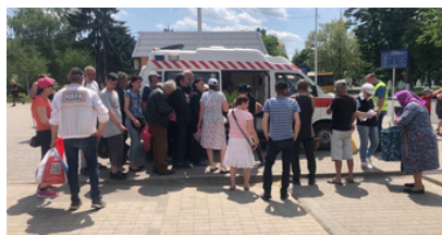
A community in Ukraine that is being served daily hot meals.