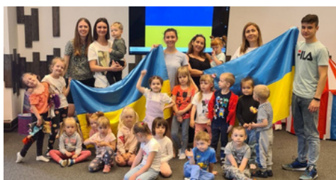
The children in the day camp in Romania.

It's been a busy past few months and we are thankful for the opportunity to share an update. When the invasion in Ukraine began February 24th, we immediately reached out to partners in Ukraine and surrounding countries. Our partners in Bulgaria had begun housing, feeding, and caring for hundreds of Ukrainian women and children who had to flee their homes. For the past 100+ days, they have continued to provide daily assistance, including school supplies, clothing, toys, day programs and more for the families that aren't able to return home just yet.